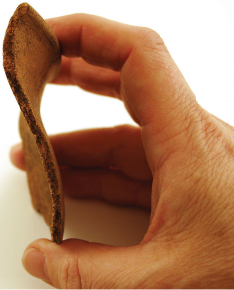
Figure 7. F 16, the curve of the sherd.

Other signs visible in the artefact that may be of importance for the interpretations are how it was placed in the grave. The vessel with a loop-like haft and the side surface where the decoration is visible and mostly intact is shown in Fig. 4, and the opposite side, where the sherds have broken away from the vessel in Fig. 5. The breakage pattern suggests that it was caused by frost, in the process known as spalling. This would have happened through moisture being absorbed into the porous material, after which the temperature dropped, freezing the water within the clay and causing the ware to “explode” from within, splitting it open. Such sherds are unique because they have only one outside or one inside surface, while sherds from a vessel that has been crushed or damaged by pressure has both an inside