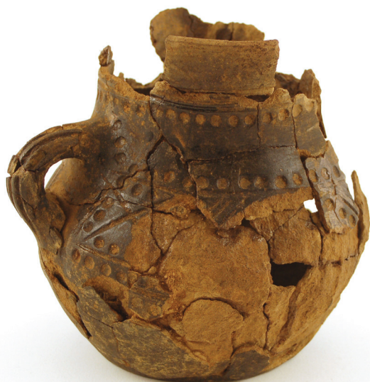
Figure 4. F 4, with a loop-like haft.