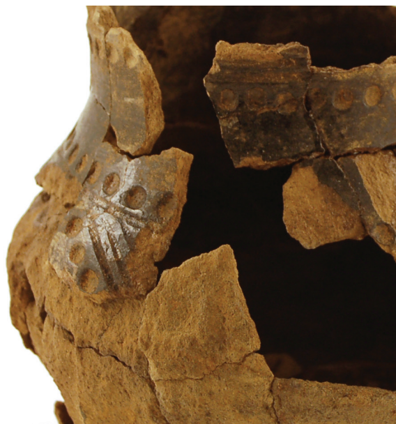
Figure 5. F 4, with a frost-cracked (spalled) surface. Photo by Katarina Botwid.

pers. comm.). While the surface is indeed black, the blackness is only about 1 mm deep and the clay is bright yellow, which points to the vessel having undergone some other post-firing treatment which would have sealed its porous surface. One way to make ceramic ware water-resistant, black and shiny is to soot the vessel when it is still hot after firing. Sooting, along with burnishing, is an early type of technique intended to seal ware, though the black surface can also be considered decorative. I regard this technique as differing from that used with pit-fired ware, so that it would be of interest to conduct experimental firings and try different post-firing techniques to investigate which technique was common in the area. Post-firing techniques are seldom discussed in connection with archaeological ceramics. The vessels have obviously not been used in a hearth, because no reoxidation has taken place on the bottom or the lower portion of the body of the pot and there are no traces of food inside them.