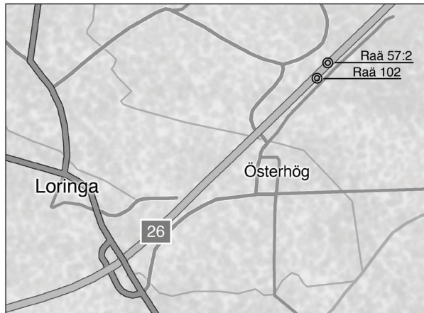
Figure 2. The excavation site at Sjögersta. Illustration by Henning Cedmar Brandstedt.

a ceramist who had professional artisanal skill, good artisanal knowledge, or artisanal knowledge. One way of evaluating the artefact in this sense is to compare the performance of one's ancient colleague with one's own knowledge as an artisan. It should become evident to the investigator how skilled the artisan was. The technical markers can be very many things, such as wall thickness, the clay mix or the totality of the action performed. Some of these values are measurable and some simply come from experiences of concrete artisanal training and tradition according to the ceramic skill, with the evaluating artisan as the instrument. The non-verbal qualities, especially those at very high levels of skill, are harder to explain in a strictly technical or scientific way, and it is my intention in further work to try to develop a qualitative method for examining evidence of skill in archaeological ceramic materials. This method could very well lean on former methods, such as the method presented by Sandy Budden concerning technological signatures for the examination of skill (Budden 2008:4). Budden's work is highly interesting and valuable, especially in the context of quantitative investigations, and I will try to contribute to it further by considering the anomalies and technical leaps that easily become lost or hidden in large-scale quantitative investigations.