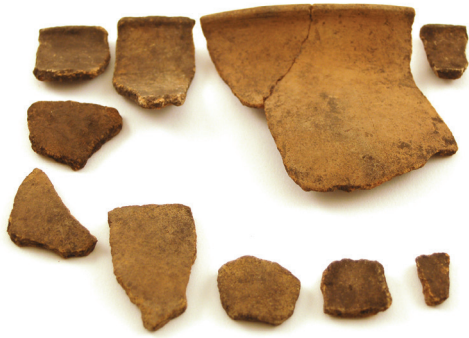
Figure 6. F 16.