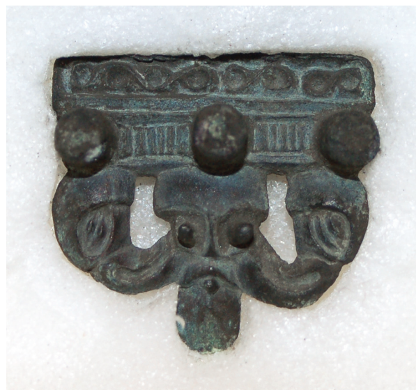
Figure 8. F 12, piece of cast bronze, Sjögersta.

Description: The original carving for the piece was probably made of wood, and each of the ornament's