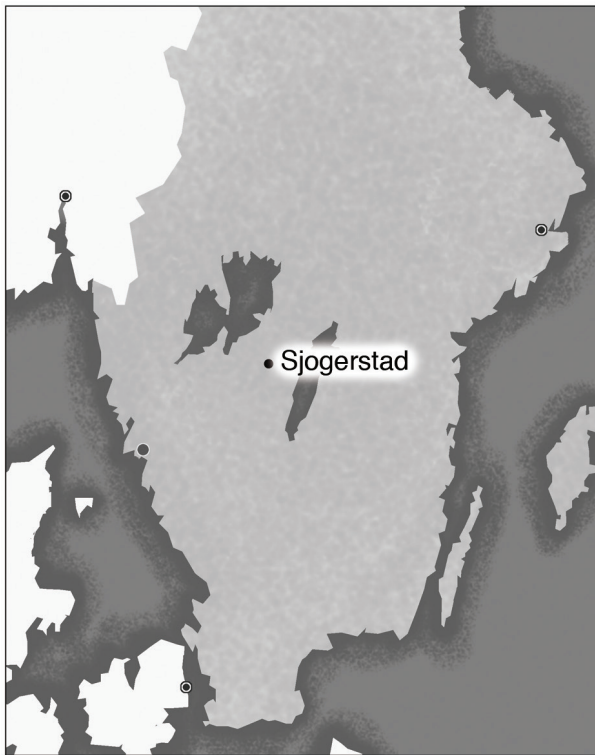
Figure 1. The parish of Sjögersta, municipality of Skövde, Sweden. Excavation site. After Västergötlands Museum 2005. Illustration by Henning Cedmar Brandstedt.

a ceramist who had professional artisanal skill, good artisanal knowledge, or artisanal knowledge. One way of evaluating the artefact in this sense is to compare the performance of one's ancient colleague with one's own knowledge as an artisan. It should become evident to the investigator how skilled the artisan was. The technical markers can be very many things, such as wall thickness, the clay mix or the totality of the action performed. Some of these values are measurable and some simply come from experiences of concrete artisanal training and tradition according to the ceramic skill, with the evaluating artisan as the instrument. The non-verbal qualities, especially those at very high levels of skill, are harder to explain in a strictly technical or scientific way, and it is my intention in further work to try to develop a qualitative method for examining evidence of skill in archaeological ceramic materials. This method could very well lean on former methods, such as the method presented by Sandy Budden concerning technological signatures for the examination of skill (Budden 2008:4). Budden's work is highly interesting and valuable, especially in the context of quantitative investigations, and I will try to contribute to it further by considering the anomalies and technical leaps that easily become lost or hidden in large-scale quantitative investigations.